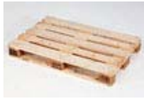
Fig. 1: A pallet

The pallet case is an interesting one because of the multiplicity of pallet sizes and the extensive use of pallets in the world. “Pallets move the world” (White 2000:1): 80 percent of US trade is carried on pallets. Each year, around 280 million of pallets circulate in the EU.